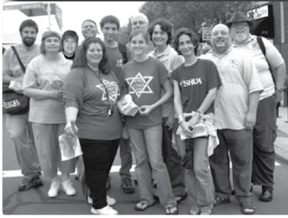
Some of our St. Louis friends at the Clayton Art festival outreach

7 Jewish believers in Jesus and 179 gentile believers in Jesus asked to hear more about how they could be involved (local churches are contacting dozens of the gentiles who are looking for church homes and we will be in touch with about 40 who asked for help in sharing with their Jewish friends).