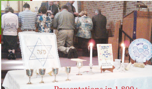
Presentations in 1,800+ churches

AOHE Success • increased Jewish first mindsets among pastors, mission sthlds, sem students, univ. students • clearly defined marketing & communication plan • clearly defined volunteer opportunities & their engagement at a strategic level • identified & established PARTNERSHIPS