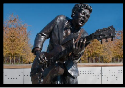
Chuck Berry Statue on the loop